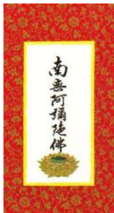
Namo Amida Butsu

forms us of the existence of Amida Buddha who had vowed to save all ordinary and foolish beings like us, by guiding us to supreme enlightenment. Furthermore, Shinran Shonin clarifies that we, as the recipient of Amida's working, have already received the Buddha's wish in the form of the Name, Namo Amida Butsu .