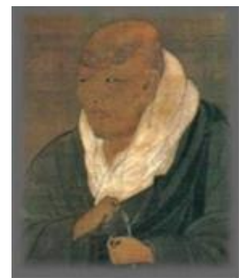
Shinran Shonin 親鸞聖人(1173-1263)

The tradition of the true Pure Land teaching speaks of birth through the Nembutsu.