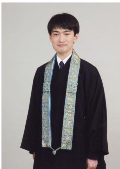
Ohtani Kojun Go-Monshu

On the Eight hundred fiftieth Anniversary of Shinran Shonin's Birth and Eight hundredth Anniversary of the Establishment of the Jodo Shinshu Teaching